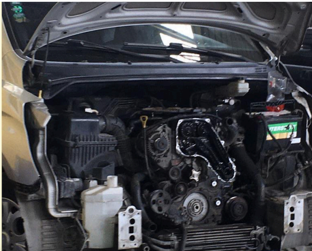
("Cloudy's first "facelift" in February to replace main timing chain)

We were also planning on installing "Bible Lesson Libraries" in two additional Dominican churches (of the 5 we have pending) after delivering the second 26 weeks of lessons to our existing churches (we have received designated gifts for adding these two churches); but we will probably not have time to do so.